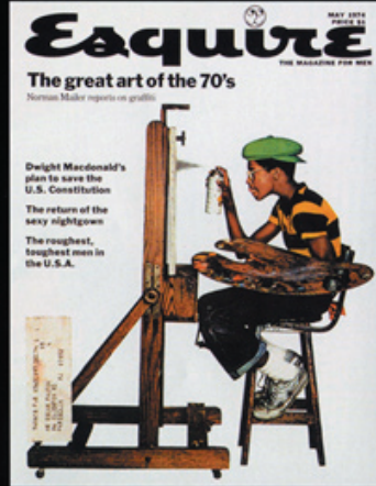
The Art of Graffiti , retouched photograph, Esquire , 1974