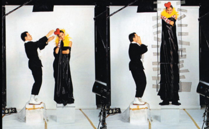
Jean-Paul Goude with Laetitia Casta in an ad for Galeries Lafayette, 2001