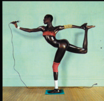
Grace Jones exemplifying the "French Correction," 1978