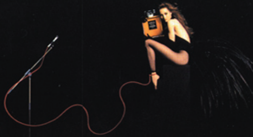
Vanessa Paradis in Coco ad, 1993