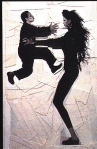
Azzedine and Farida, collage photograph with adhesive tape