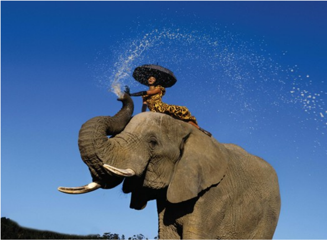
A Jean Paul Goude photograph.

For a man who rarely speaks with the media, photographer Jean-Paul Goude is surprisingly candid when such an occasion arises. Or maybe that's precisely why he doesn't often talk to reporters. For more than 30 years, Goude's private life and work have been inextricably linked, and as a result, his work has become a running biography of the childish reveries of early years, his complicated relationships and his exotic fantasies.