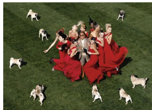
A Jean Paul Goude photograph.

WWD: You are obviously well known for your relationship with Grace Jones, whom you have described as "beautiful and grotesque at the same time." It's also been reported that you both